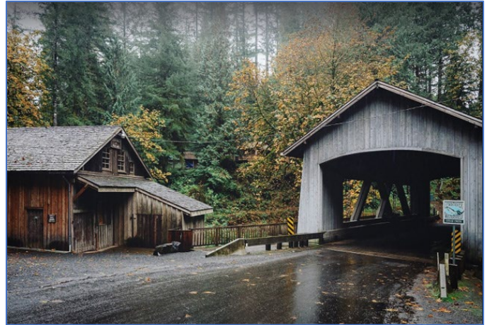
Cedar Creek Grist Mill

As always, it is helpful to be familiar with Cascade's Road Rally Rules when participating in one of our events. Like most competitions, TSD road rally is a rules-based game. This rally specifically mentioned in the Rallymasters' Notes accompanying the Rally Route Instructions, "To be most successful in this rally, it will be helpful to be familiar with Main Road Determinants (RRR 3)." That was true in spades for this event.