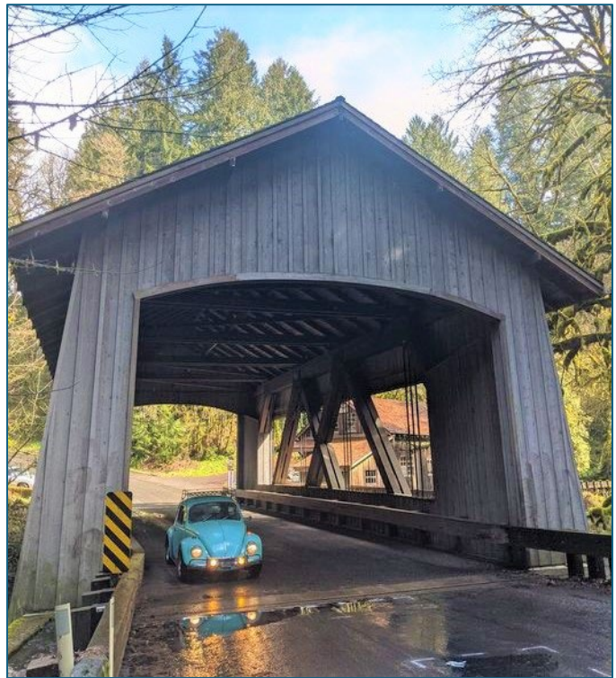
Covered bridge at Cedar Creek Grist Mill